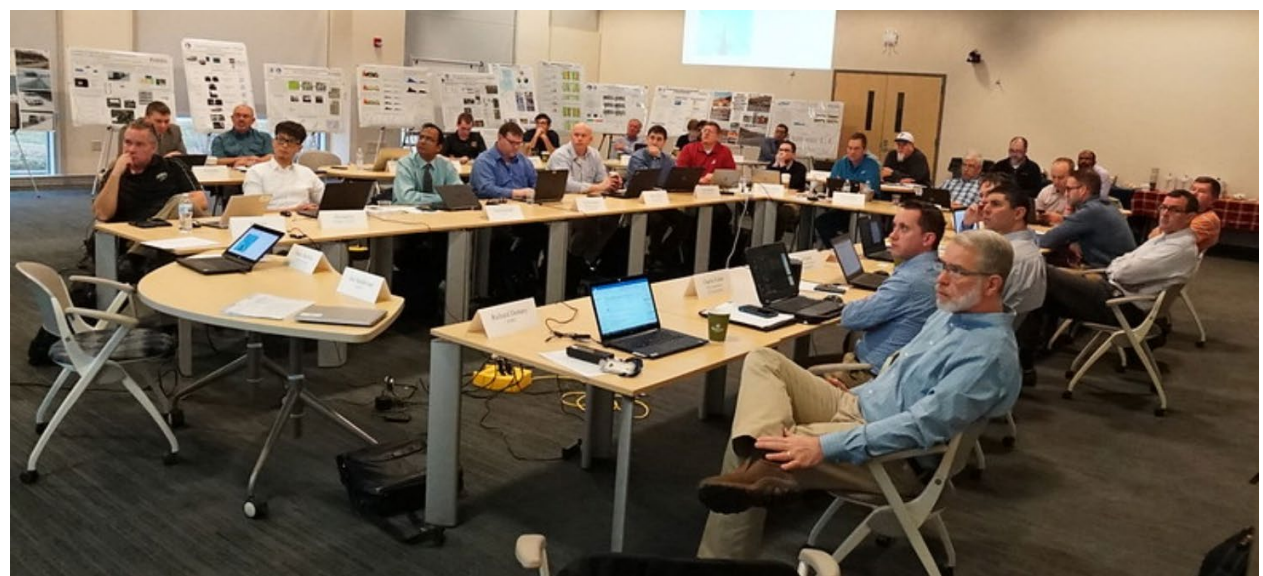
Figure 1: Photography of panel meeting on March 28, 2019 in West Lafayette, IN.

Private sector participants provided a brief overview of the topics-of-interest for the vendor panel discussion to follow the next day. The vendor moderated panel on day 2 discussed the enumerations activities, challenges and future opportunities. Representatives from the auto industry (Audi/Ford) discussed interests of automotive industry in traffic signal performance measures