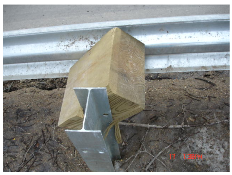
Figure 1. Guardrail blocks on US 52