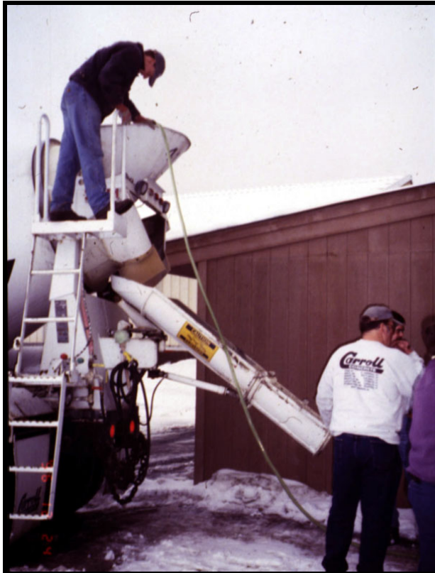
Phase III goal: The right dosage for strength, durability, and economy.

Guidance for Optimizing Admixture Dosage Rates