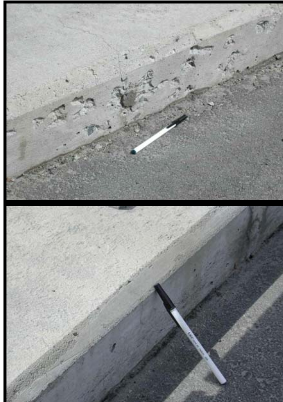
Phase I: West Lebanon bridge repair after two winters. Top = control concrete noticeably spalled. Bottom = antifreeze concrete in good condition. Phase II testing corroborates this result by suggesting that antifreeze concrete can be more durable than ordinary concrete.