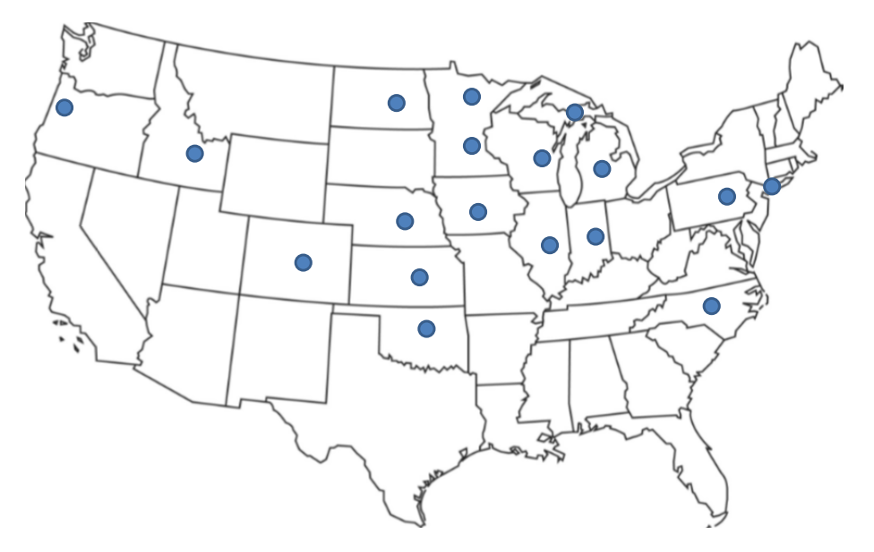
Figure 2 – Current estimate of freeze thaw exposure conditions to be measured.

These beams will be designed so that some fail while some perform well based on our previous lab experiments and so results should be obtained quickly. However, because the beams are in different environments this will give the users great insight into how their particular environment compares to others and to the standard freeze thaw testing. The data loggers will be designed so that new beams could be added to the states in the future and they can be continue to be used. These same samples will also be evaluated in Task 16 to enable the gages to be compared to the very precise laboratory measurements. These data loggers have been tested heavily at Oklahoma State for robustness and have survived heavy rainstorms, tornados, and earthquakes.